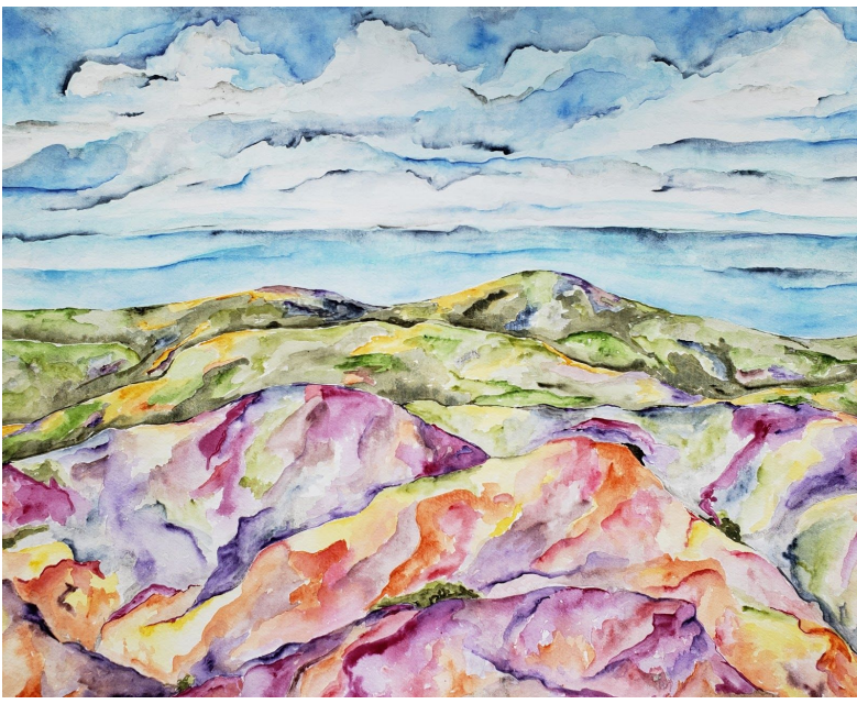
West Seattle Art Walk Participation History: Verity, December 2018